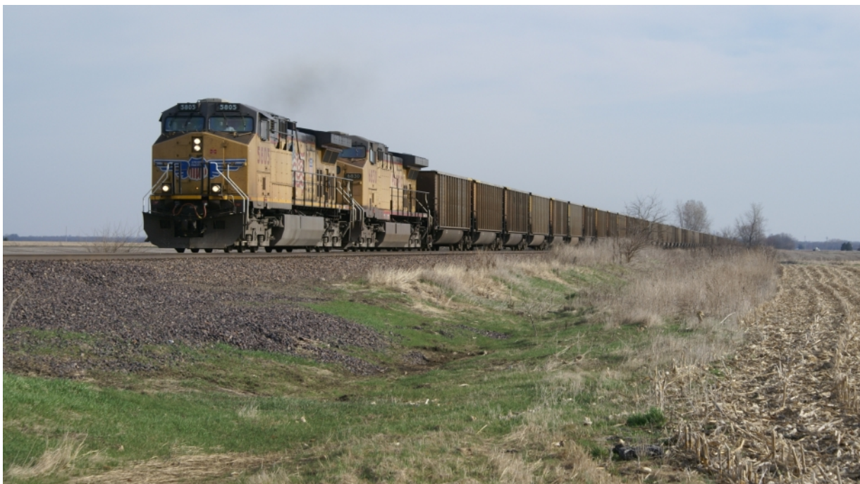
Union Pacific 5805 and 6830 lead an empty NORX coal train, with DPU on the rear, south near the top of the hill at Daily, Illinois on April 2, 2010.

Visit our Chapter WWW Home Page On-Line - http://www.danvillejct.org