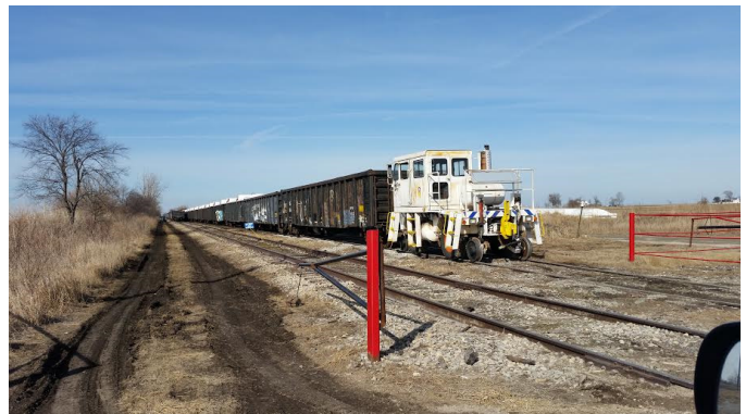
The Appalachian Railcar Services facility in Earl Park, Indiana is located on the old NYC Cario line just north of Sheff, Indiana (former Kankakee to Lafayette crossing of the Schneider to Danville segments of the NYC). The KBSR still goes down to an elevator about two miles south of Sheff so both interchanges are still being used, but not the diamond.

Editor: Can you imagine what this will be like for the freight railroads when a 100+ car train gets stopped due to "bugs in the software" and it occurs in the middle of a town?