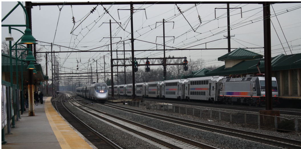
Amtrak 2166 and New Jersey Transit 3251 at Rahway, NJ. Photo by Dick Brazda January 15, 2016